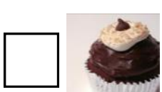
S'Mores Chocolate cupcake with a marshmallow center capped with chocolate ganache