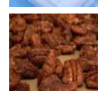
Candied Pecans Slow roasted whole pecans with a delightful, not-too-sweet coating. 1/2 pound bag.