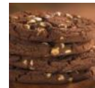
Fudge Nut Brownie Cookies One dozen fudge cookies with walnuts and chocolate chunks