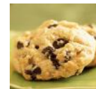
Chocolate Chip Cookies One dozen extra Large, Extra Decadent chocolate chip cookies