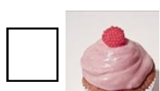
Tickled Pink Delicate vanilla cupcake with a luscious raspberry cream center and cream cheese buttercream