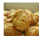
Peanut Butter Cookies One dozen perfect Peanut Butter Cookies with peanut chunks