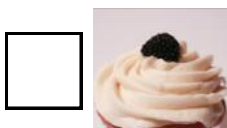
Lemon Squeeze Lemon cupcake with a raspberry center topped with cream cheese buttercream