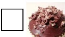
Ciao Bella Delicate vanilla cupcake with a strawberry center and topped with Nutella