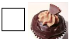
Peanut Butter Cup Chocolate cupcake with a creamy peanut butter center capped with chocolate ganache