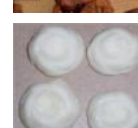
Cream Cheese Mints Smooth creamy and not too minty-they are simply divine! 75/ box