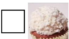
Coconut Cloud Coconut cupcake with fluffy cream cheese center and icing