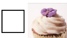
Manilla Vanilla Vanilla cupcake with our signature cream cheese buttercream