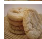
Vanilla Sugar Cookies YUM!