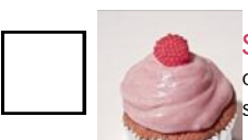
Strawberry Shortcake Vanilla cupcake with a strawberry cream center topped with our signature cream cheese buttercream